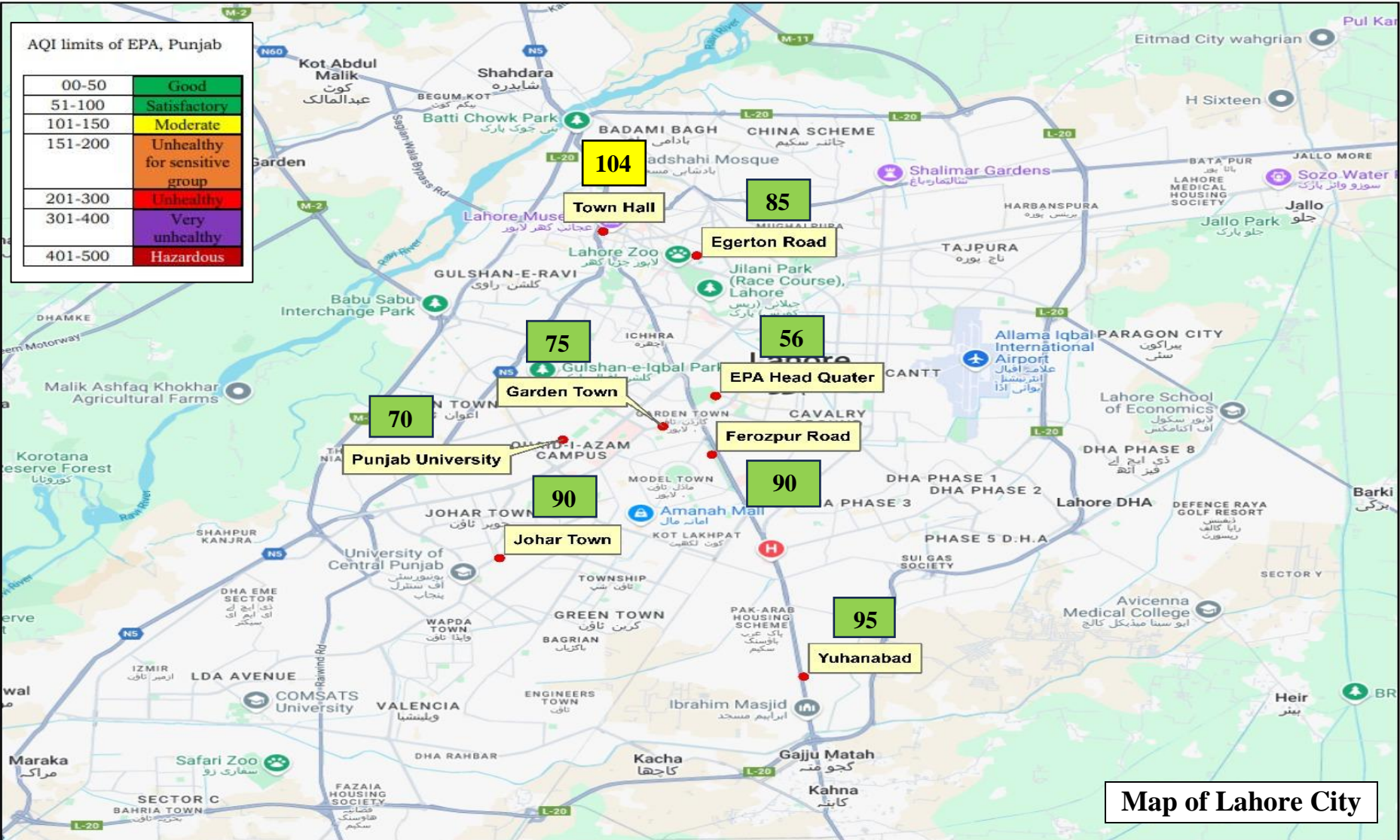
Map of Lahore City

Note: Parameter used to Calculate AQI = Particulate Matter (PM2.5) -PEQs value of PM2.5= 35 µg/m 3 . All hourly values of AQI in Lahore are monitored by EPA Punjab- Air Quality Monitoring Station.